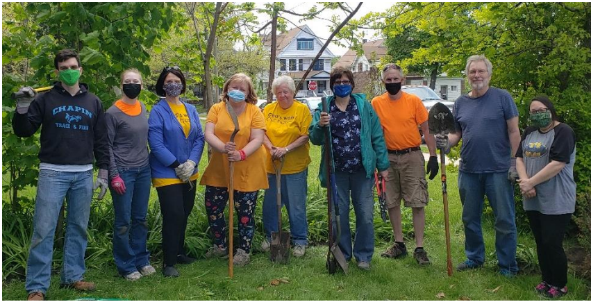
Good Soil helps with landscaping the yard of one of LMM's Breaking New Ground houses, L to R: