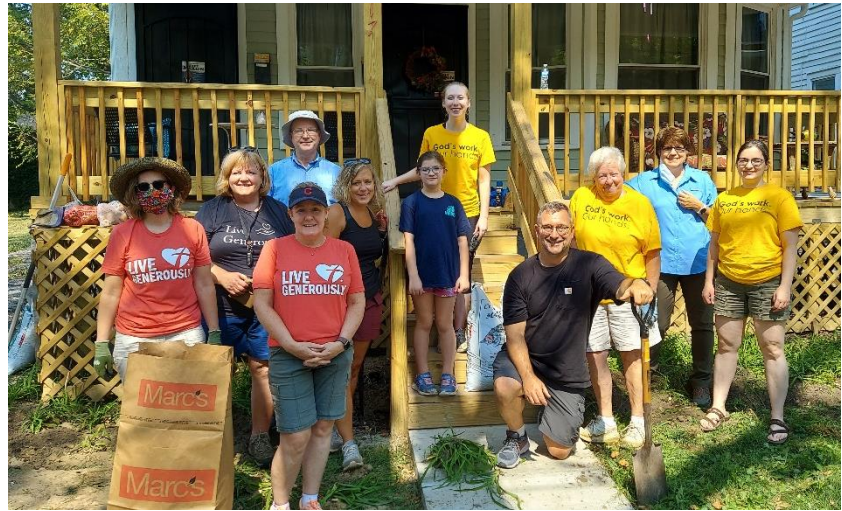
Members of Good Soil and Trinity Lutheran, Lakewood serve together on God's Work Our Hands Sunday by helping to prepare the outside yard of one of LMM's Breaking New Ground houses.