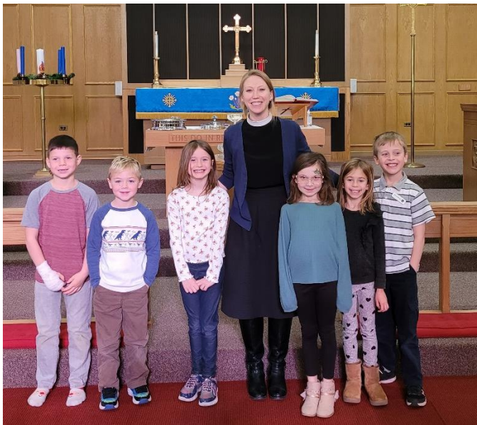
Communion Instruction Class December 2022: (Left to Right)