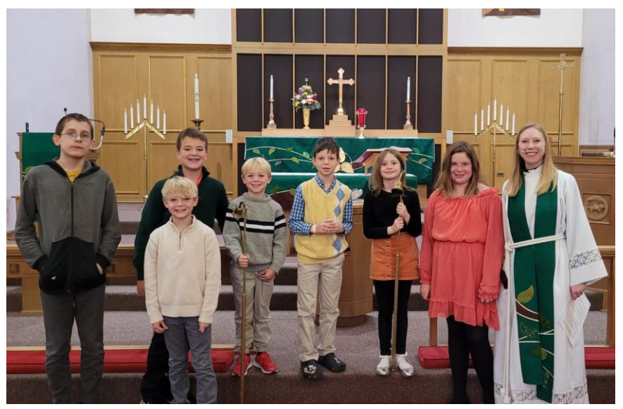
Figure 10 - Acolyte training October 2023.

Good Soil Lutheran Ministries | Rocky River, Ohio