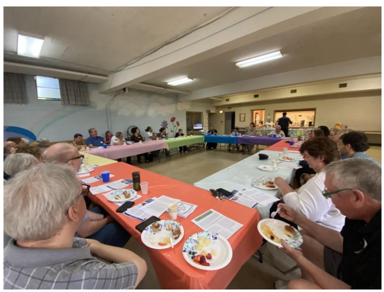
Figure 8 - Reconciling in Christ launch and discussion event, Aug 2023

designated leader who will help to guide continued "seeding" through innovative activities, more exceptional events, and the acquisition of new resources enabled through these budget allocations.