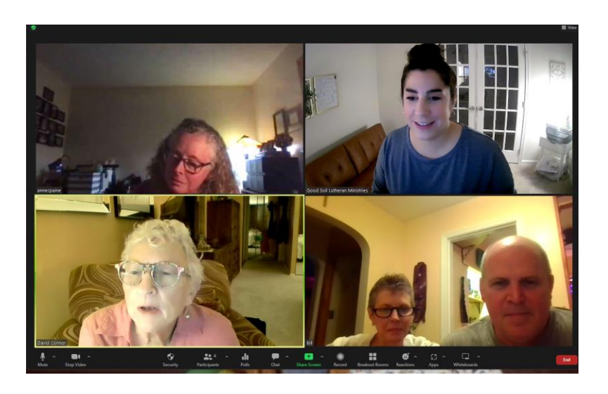
Figure 6 - Small Groups discussing Beyond Chit Chat, Fall 2023

As disciples of Christ, we are called to support one another, our community, and the wider world by sharing God's love. We do this, in part, by growing deeper in our relationships with God and one another. The use of social media, online worship, and other online activities has expanded our faith witness in the communities of Rocky River, Lakewood, Cleveland, and beyond. We aim to continue engaging in fellowship and growth activities that are enriching and faith-deepening, as well as connecting spiritually with others — including young people and families — through online platforms and tools.