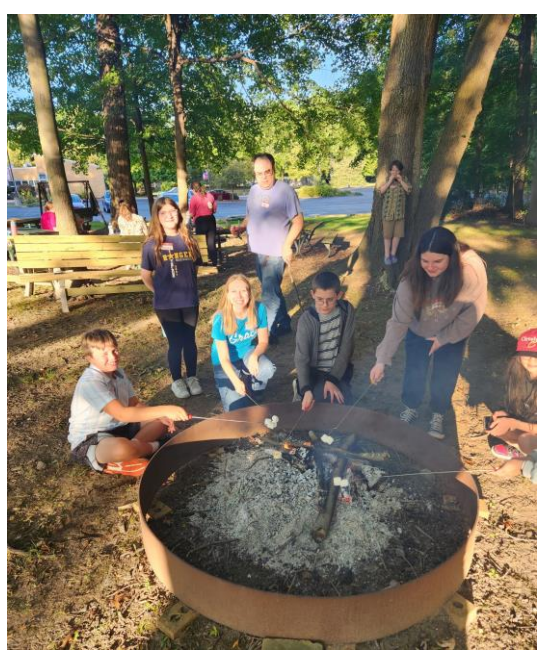
Figure 7 - Confirmation Fellowship Event September 2023