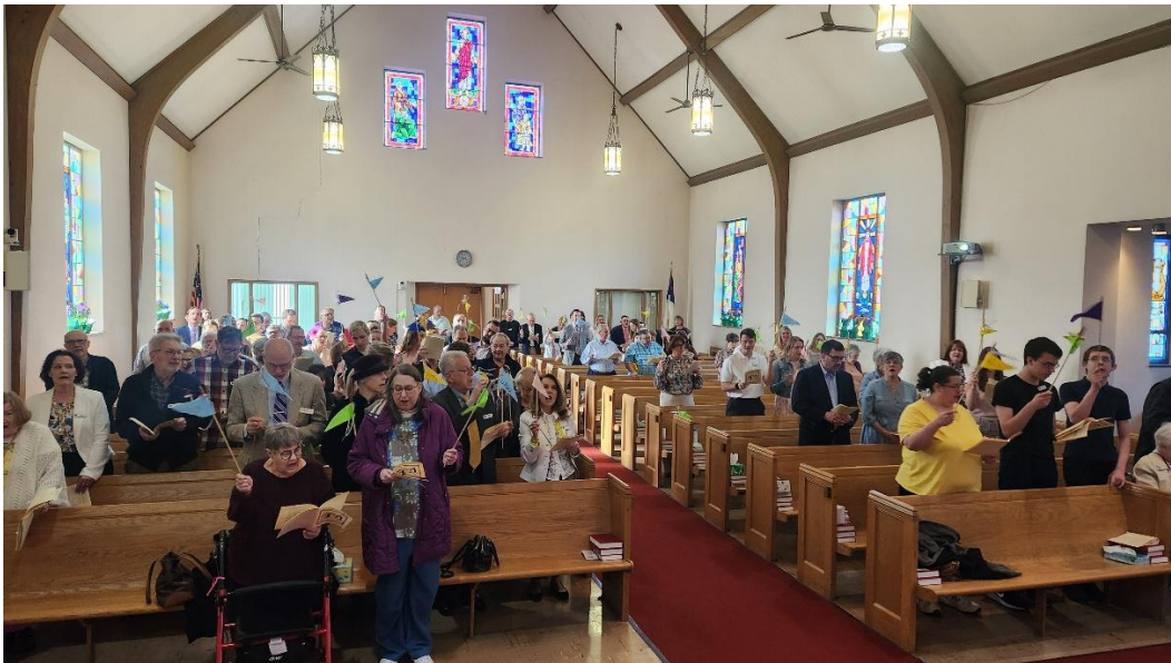
Good Soil celebrating in worship on Easter Sunday, 4/20/25

To view the New Members introduction booklet from June 2025, click here .