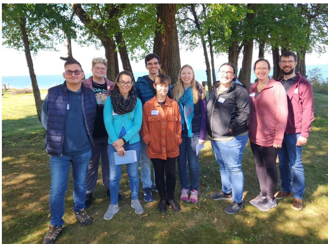
Gather Together retreat at HopeWood Shores, 10/12/24