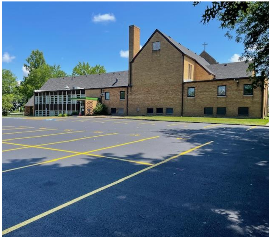
New Parking Lot, 2024