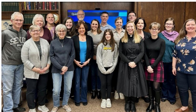
Good Soil and Bethesda on the Bay's leaders learn about the call process, 4/1/25