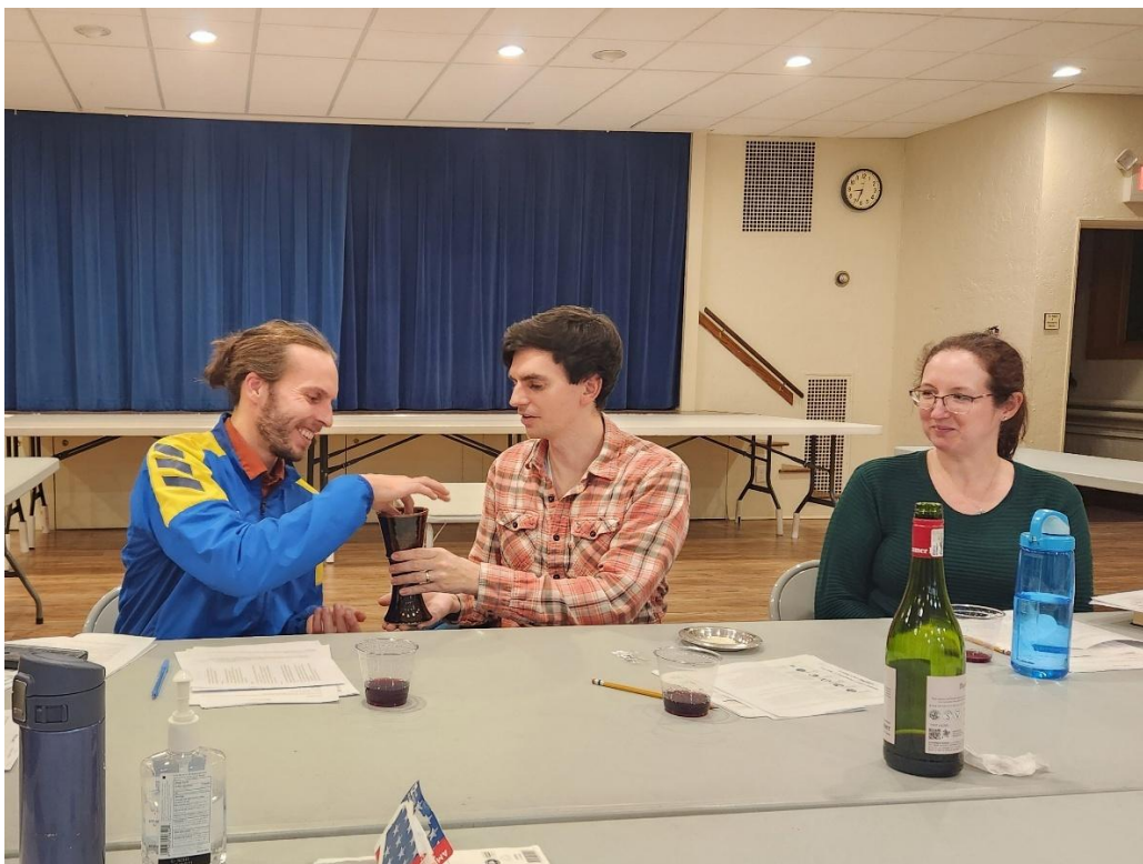
Gather Together sharing communion at Friendsgiving Dinner Church, 11/16/24