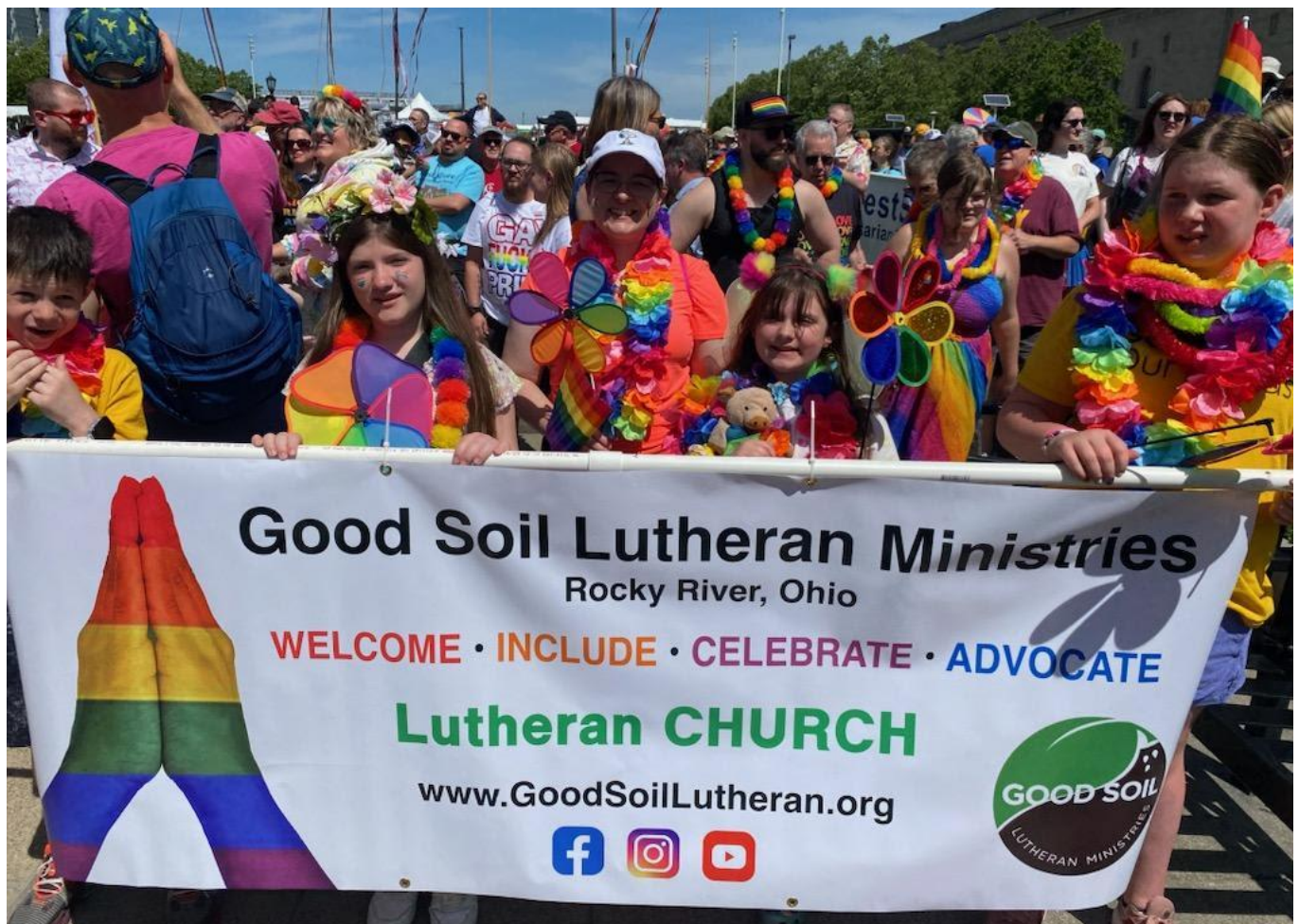
Good Soil marching in the Cleveland Pride Parade, June 2024

Respectfully submitted, Kirsten Reading, on behalf of the RIC Team, 2025