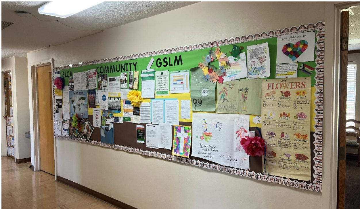
Good Soil's hallway bulletin board has 3 sections: ELCA, Community, and Good Soil. Announcements and flyers are posted and monitored by the CCLC.