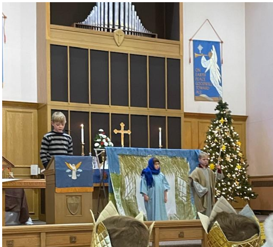
Good Soil Sunday School kids proclaim the Good News in the 2024 Christmas Pageant